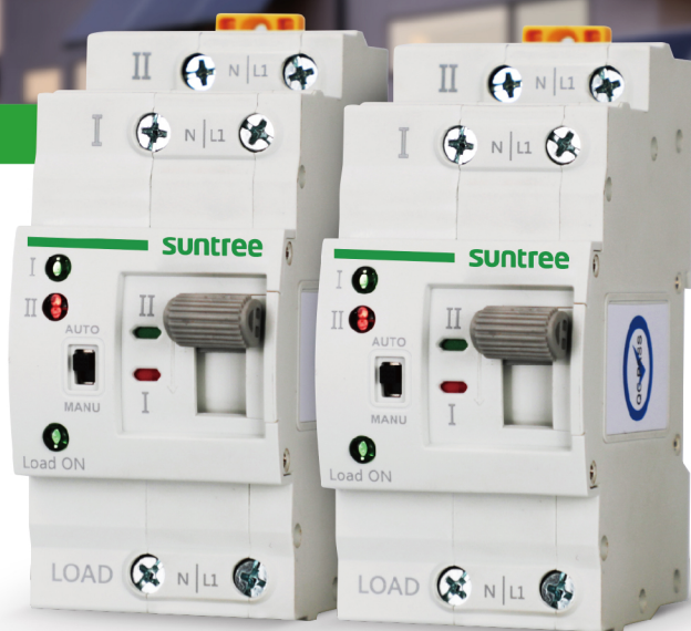
SQ8T-63 Automatic transfer switch

automatic transfer switch is a PC class infrequent change-over switch, with two-station design (commonly used for A and standby for B), suitable for AC systems with AC 50-60Hz and rated current 6A-63A. The main function of the automatic transfer switch is when the main power (common power supply A) fails, the ATS will automatically switch to the backup power (Backup power supply B) to continue working (switching speed <50 milliseconds), which can effectively solve the troubles caused by power outages.